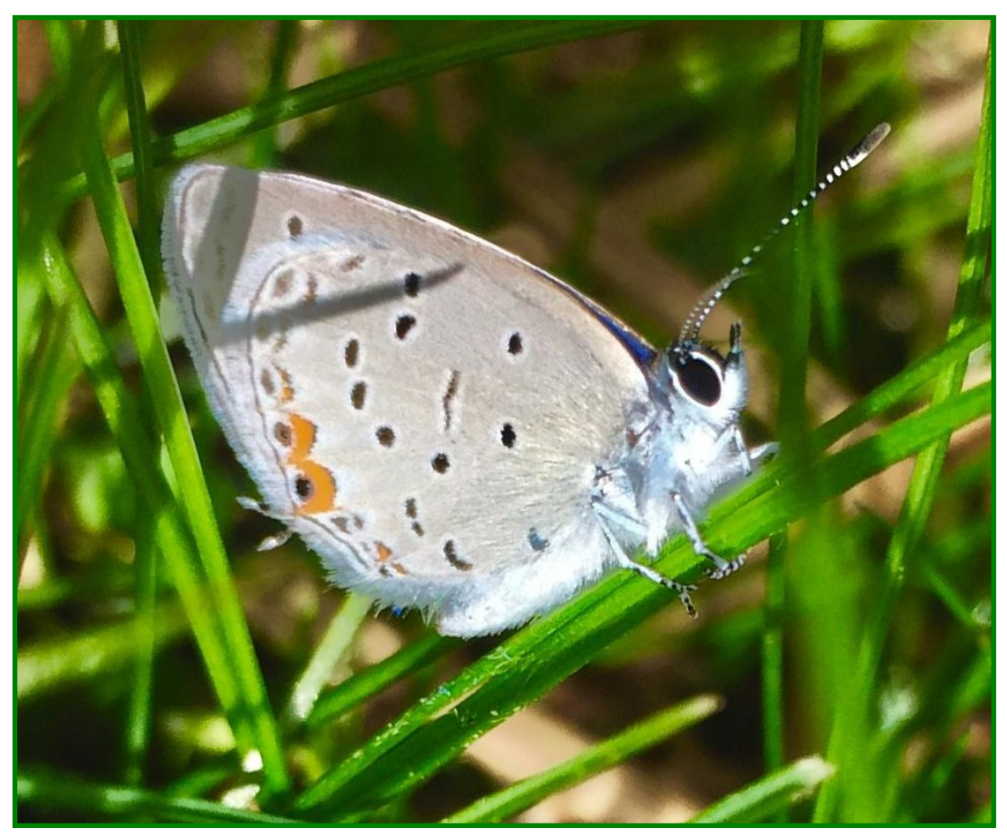
Eastern-tailed Blue, Everes comyntas