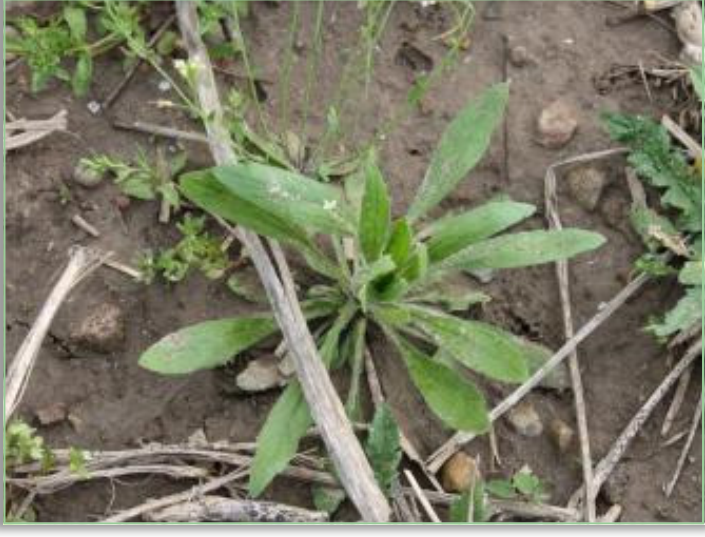
Horseweed (Marestail) (Conyza canadensis (L.) Cronq.)

source: Michigan State University, https:// www.canr.msu.edu/weeds/extension/marestailhorseweed